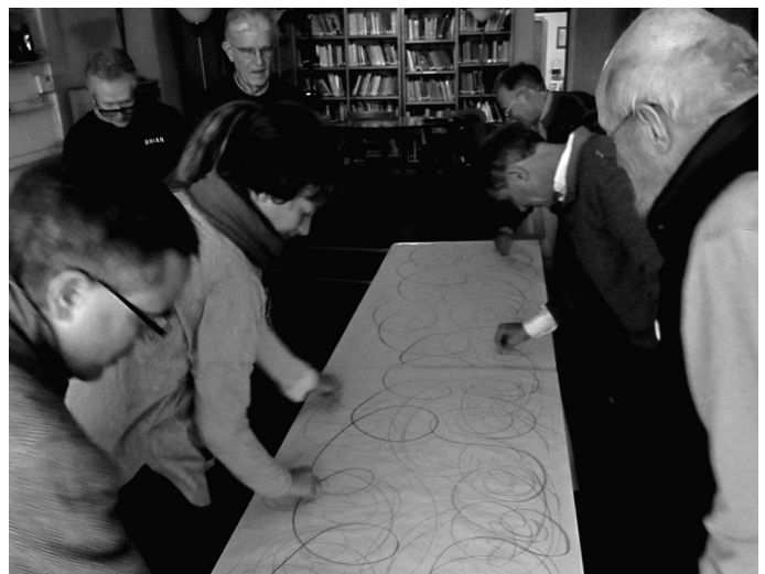
Observing the fluid patterns forming on bubbles; a drop picture telling the “story” of spring water; an exercise in drawing vortices