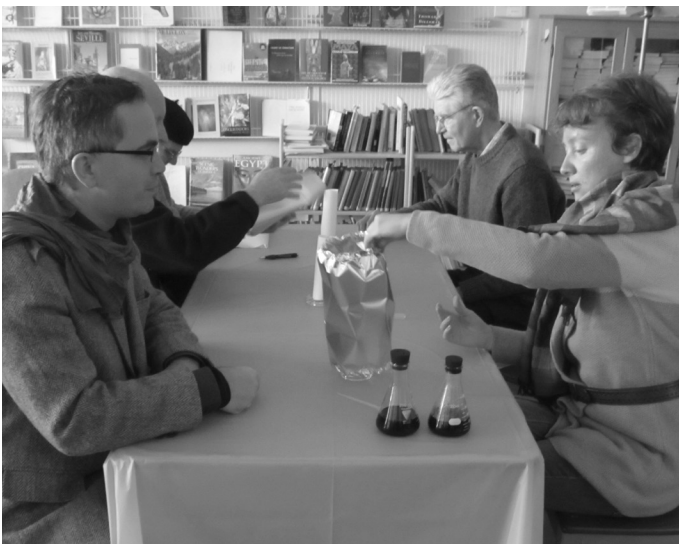
Hands-on exercise making rising pictures (Capillary Dynamolysis Method, CDM)

ventionally-bred organic feed grains no longer provide enough. Walter has varieties of corn with an adequate content of the amino acid and generally a higher quality protein composition. He is also breeding corn that will prevent cross-contamination by genetically-engineered pollen—a very serious problem for organic corn growers.